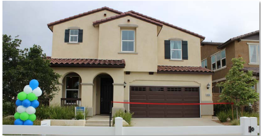
Median Priced Homes